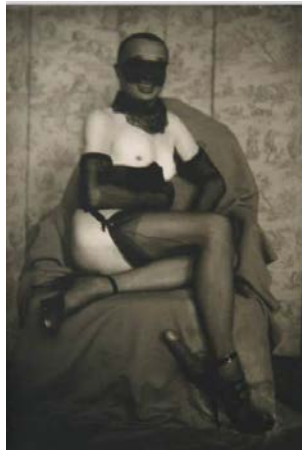
Fig.1 , Pierre Molinier, Self Portrait, 1970.

Pierre Molinier's photographs capture an image that is confusing, even bordering on the pornographic. In one photograph, he is wearing black stockings and high heels, posed on a chair in a seductively feminine manner often seen in advertisements, and his lips are extremely dark. The photograph is in black and white, which further emphasises the visual impact of the naked white skin. Garter belts, high heels and corsets are common themes in Molinier's work, and through these photographs Molinier presents an image: a transvestite.